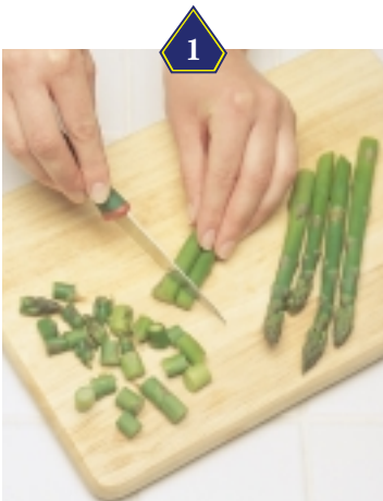
Cook asparagus in boiling salted water until tender. Drain and chop.