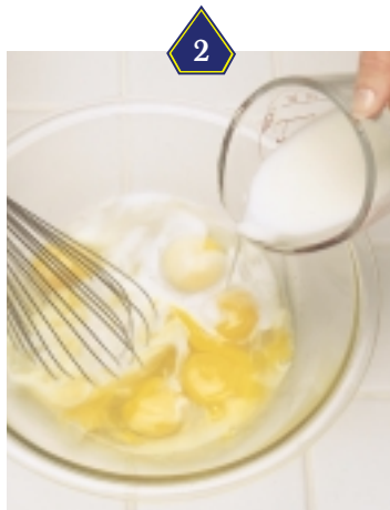
Beat eggs together with milk.