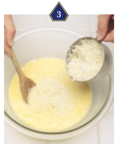
Add grated cheese, and season with salt and pepper.