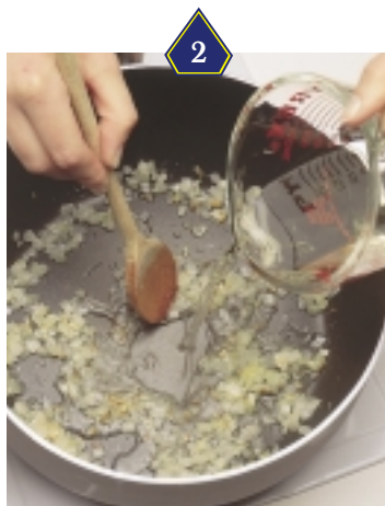
2 Heat olive oil in a large pot over medium heat. Cook onion until soft. Add garlic and wine. Cook for 5 minutes over medium-high heat.