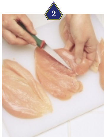
With a sharp knife, cut almost through chicken breasts lengthwise and open flat.