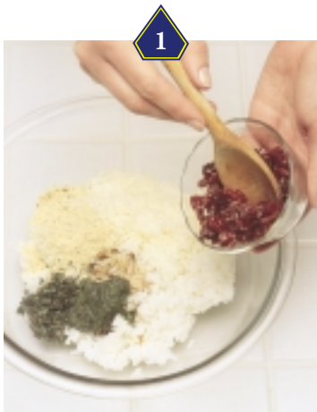
In a bowl, combine rice, bread crumbs, Parmesan, sundried tomatoes, oregano, pesto sauce and egg. Season with salt and pepper; set mixture aside.